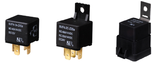
NVF4-1 26.5×26.5×24.5(+16) NVF4-2 35.5×35.5×45(+21.8) NVF4-2b